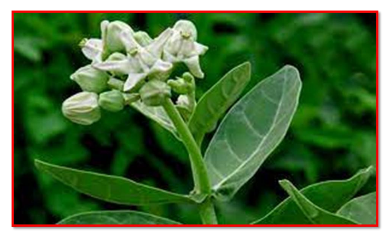
Figure.1 Showing White ekka (C. gigantea) plant